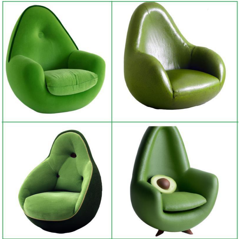
Input: An armchair in the shape of an avocado

DALL-E 2 DALL-E 2 is an AI system that can create realistic images and art from a description in natural language.